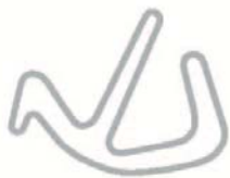
international gp 2.10 Miles