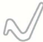
national 1.20 Miles